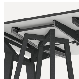
Holder for FLEXLAB stools and tidy boxes