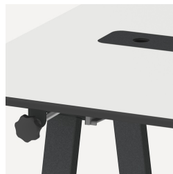
Multifunctional thanks to various equipment options