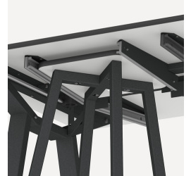
Holder for FLEXLAB stools and tidy boxes