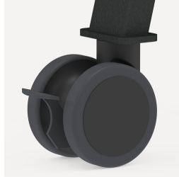
Four large double castors, each with fixed brakes