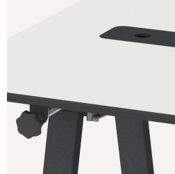
Multifunctional thanks to various equipment options