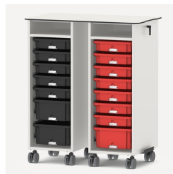
Additional work surface thanks to top shelf