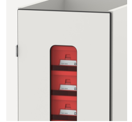
The glazed front provides a clear view of the materials