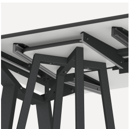
Holder for FLEXLAB stools and tidy boxes