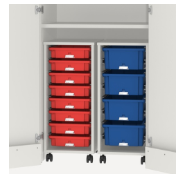
Storage space for up to two material trolleys