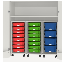
Storage space for up to three material trolleys