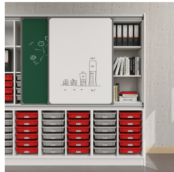
Sliding panel with aluminum guide rails and additional storage space behind the panels