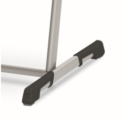
Floor protectors with integrated step protection