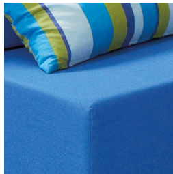
Maximum comfort due to foam core and rounded corners