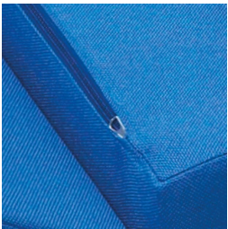
Cover removable by zipper