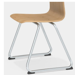
Stable sled frame