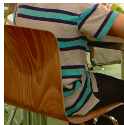
Ergonomically shaped and flexible shell