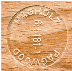
PAGHOLZ® from sustainable forestry