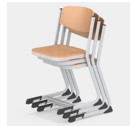
Stackable up to 3 chairs (size 7)