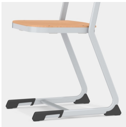
Stable and solid C-shape frame