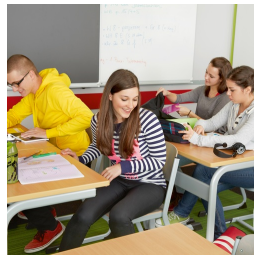
No disturbance of the chair legs when getting in and out of the chair