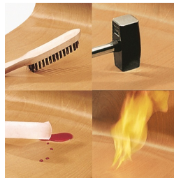
Seat and back melamine coated: scratch, break and impact resistant; flame retardant