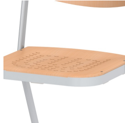
Seat surface with pressed-in, anti-slip knobs