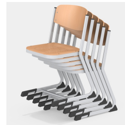
Stackable up to 5 chairs (size 2-6)