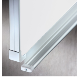
Matching shelf for chalk and pens