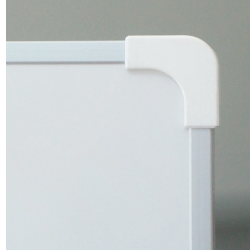
Edge protection due to rounded safety corners