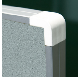
Edge protection due to rounded safety corners