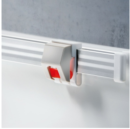
Optionally with picture clamping bar