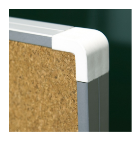
Edge protection due to rounded safety corners