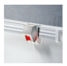
Optionally with picture clamping bar