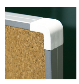
Edge protection due to rounded safety corners