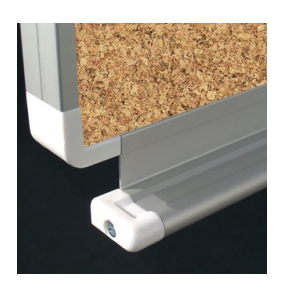
Matching shelf for chalk and pens