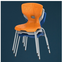
Stackable up to 3 chairs (without upholstery)