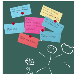
Magnetic surface can be written on with chalk