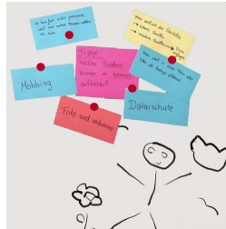
Magnetic surface can be written on with whiteboard pens