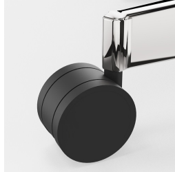
Load-dependent braked safety casters prevent unintentional rolling away