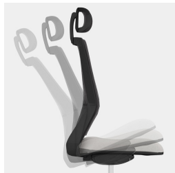
Self-weighting synchronous mechanism automatically adjusts spring force or resistance