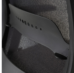
Black mesh backrest, with lumbar support adjustment