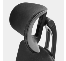
Headrest with mesh cover, height adjustable