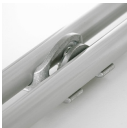
Optionally with row connection from size 5