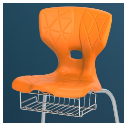
Optionally with book tray from size 5