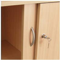
Smooth sliding doors