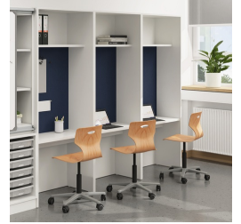
Side panels for better glare and privacy protection