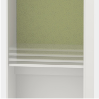
Height-adjustable table top; optional cable aperture