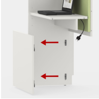
Removable bezel for easy cable routing