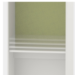
Height-adjustable table top; optional cable aperture