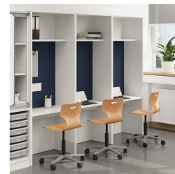
Side panels for better glare and privacy protection