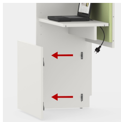
Removable bezel for easy cable routing