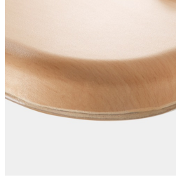
Optional WOODMARK table top in shatterproof quality