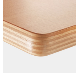
Optional table top multiplex melamine coated