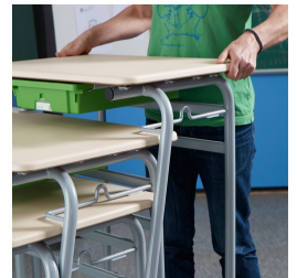
Up to 4 tables stackable, also with accessories