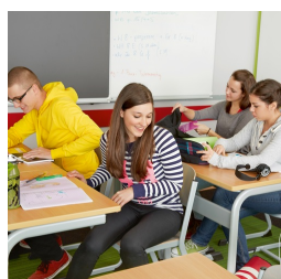
Due to C-shape no disturbance of the table legs when getting in and out of the table