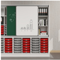
Sliding panel with aluminum guide rails and additional storage space behind the panels