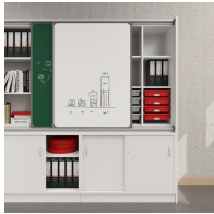
Shelf attachment with tidy boxes behind the panels