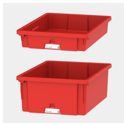
Tidy boxes for storing gloves, hats etc.