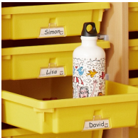
robust Tidy Boxes