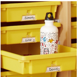
robust Tidy Boxes