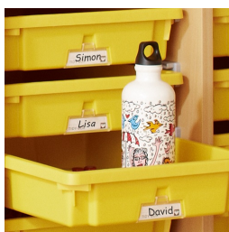
robust Tidy Boxes