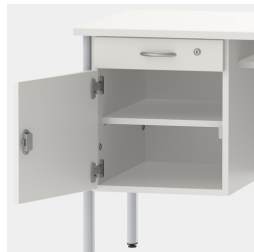
Base cabinet includes drawer, lockable by means of safety lock