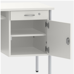
Base cabinet includes drawer, lockable by means of safety lock