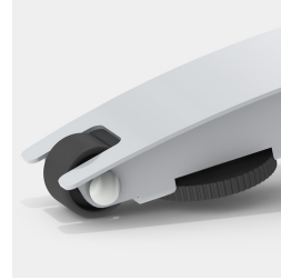
Mobile due to 2 casters on the rear edge of the base, with slight incline