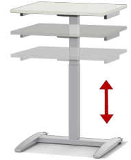
Infinitely variable height adjustment in the range 70-110 cm