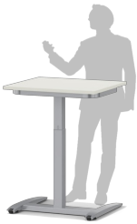
Can also be used as a mobile lectern