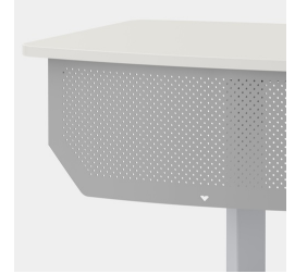
Perforated plate front panel included