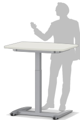
Can also be used as a mobile lectern