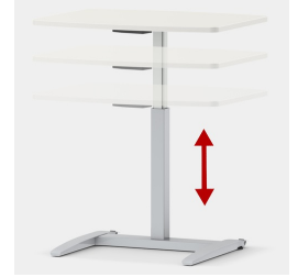
Infinitely variable height adjustment in the range 70-110 cm