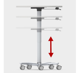
Infinitely height adjustable in the range of 77-116 cm