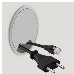
Optionally with side cable aperture