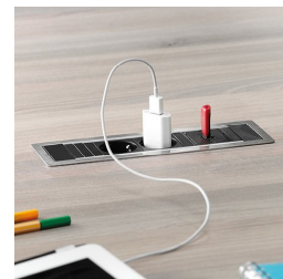
Optionally two floor sockets each with USB port or network connection: left and right