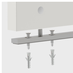
Optionally with floor mounting