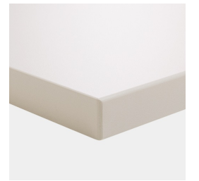
Board material melamine coated with robust plastic edge