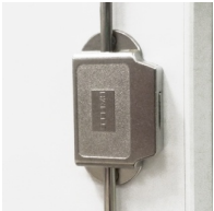
High quality locking bar