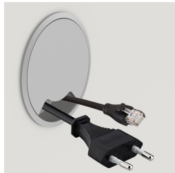
Optionally with side cable aperture