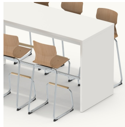
Seating on both sides