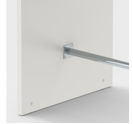
Footrest included for comfortable resting of the feet