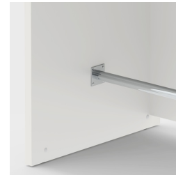
Footrest included for comfortable resting of the feet