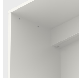
With integrated cable duct, rear