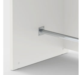
Footrest included for comfortable resting of the feet