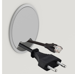
Optionally with side cable aperture