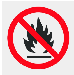
Support panel material flame-retardant according to DIN 4102 B1