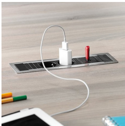
Optionally two floor sockets each with USB port or network connection: left and right