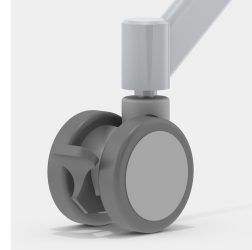
Including 4 robust double swivel casters with total locking device