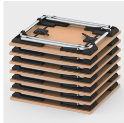
Stackable up to 16 tables