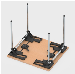
Easy folding of the table legs