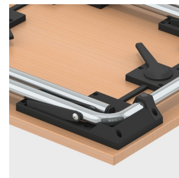
Stacking protectors protect the table top from scratch marks